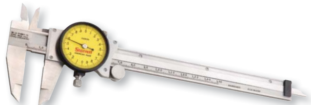
120AM-150 metric dial caliper with yellow dial