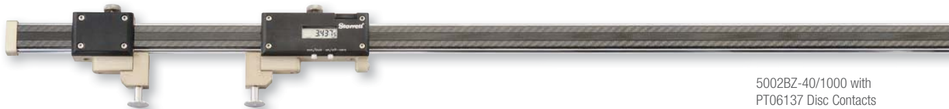
5002BZ-40/1000 with PT06137 Disc Contacts