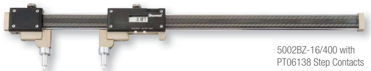
5002BZ-16/400 with PT06138 Step Contacts