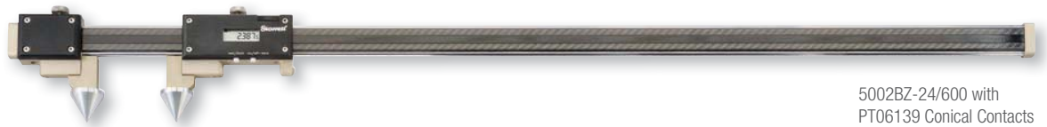
5002BZ-24/600 with PT06139 Conical Contacts