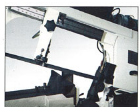
Hydraulic saw arm lifting system for CF-250A & CF-250AA

10" x 18" 2 Way Swivel Infinity Variable Speed